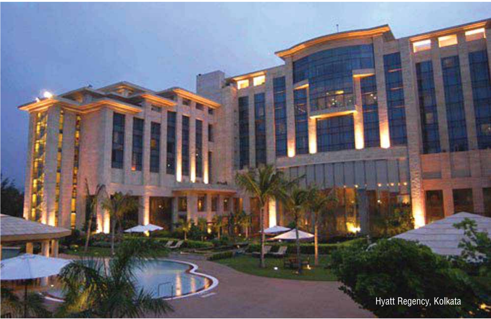
Hyatt Regency, Kolkata