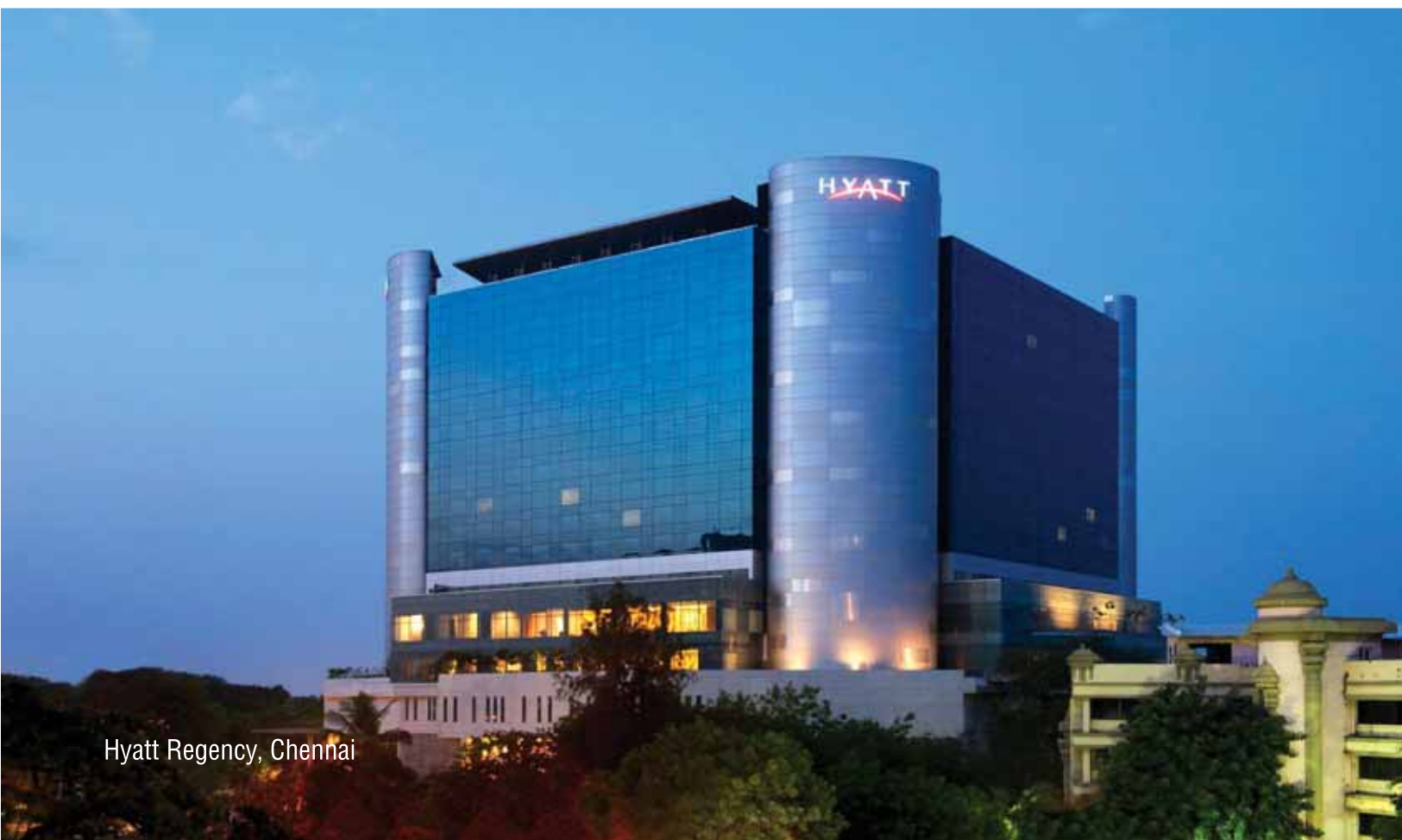
Hyatt Regency, Chennai