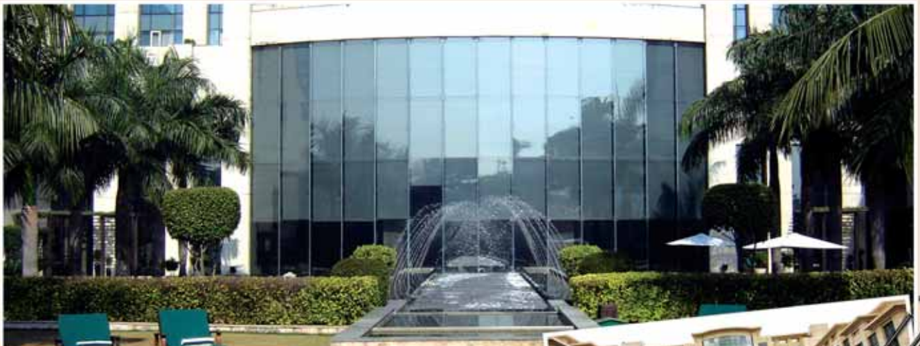
HYATT REGENCY KOLKATA