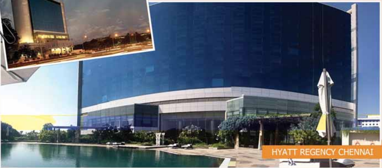
HYATT REGENCY CHENNAI